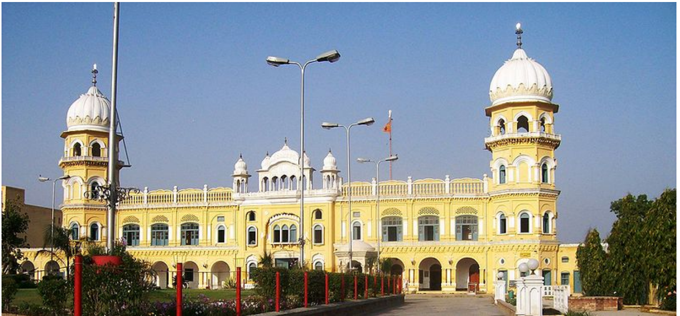
Gurdwara Nankana Sahib, Pakistan

Ram. Guru Nanak also found work with Daulat Khan, when he was around 16 years old. This became a formative time for Guru Nanak, as the Puratan Janam Sakhi suggests, and as evidenced in his numerous allusions to governmental structure in his hymns, most likely gained at this time. [6]